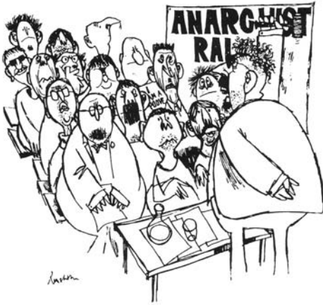
"Gentlemen, gentlemen! Disorder, please, disorder!"

spreading of acts of sabotage. The anonymous practice of social self-liberation could spread to all fields, breaking the codes of prevention put into place by power.